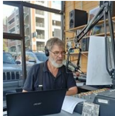
ART MENIUS RADIO & MAILING SERVICE

NACC Folk Chart: Four Top 6, 9 Top Thirty; 14 #1 on Top 5 Folk Adds Charts